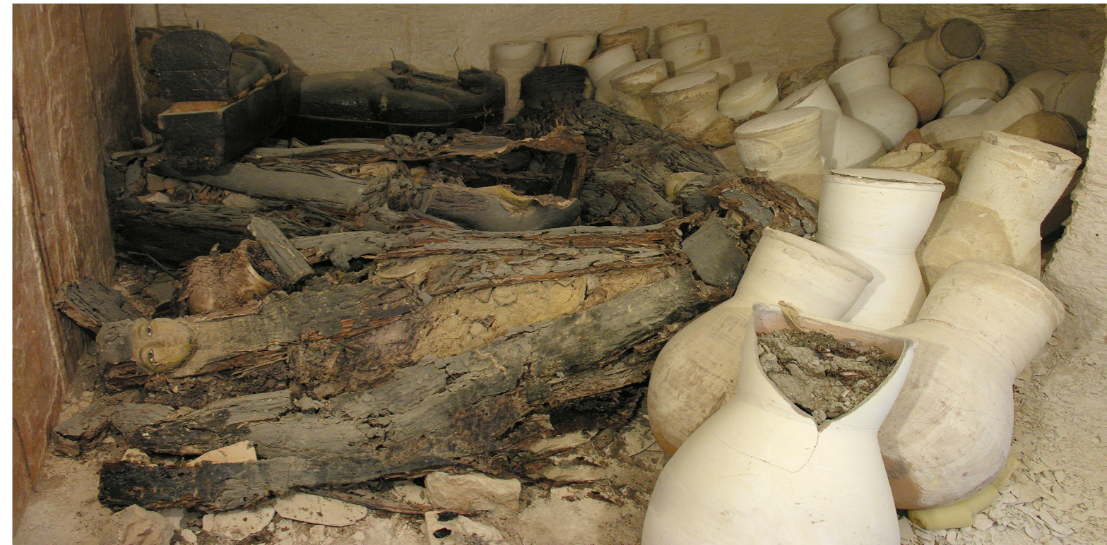
KV63 as it was found in 2006. Coffin A, badly damaged by termites, lays in the foreground.

Ramesses XI's empty tomb found a new use: a state-sanctioned workshop where royal mummies were relieved of their valuables before being moved to hidden caches, safe from unofficial rummaging. Butehamun was literally digging for royal gold, and the scribe earned a new title: "Opener of the gates in the necropolis."