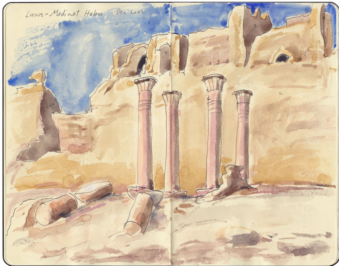
Ruins within Medinet Habu Temple. Ink and watercolor, 2002.