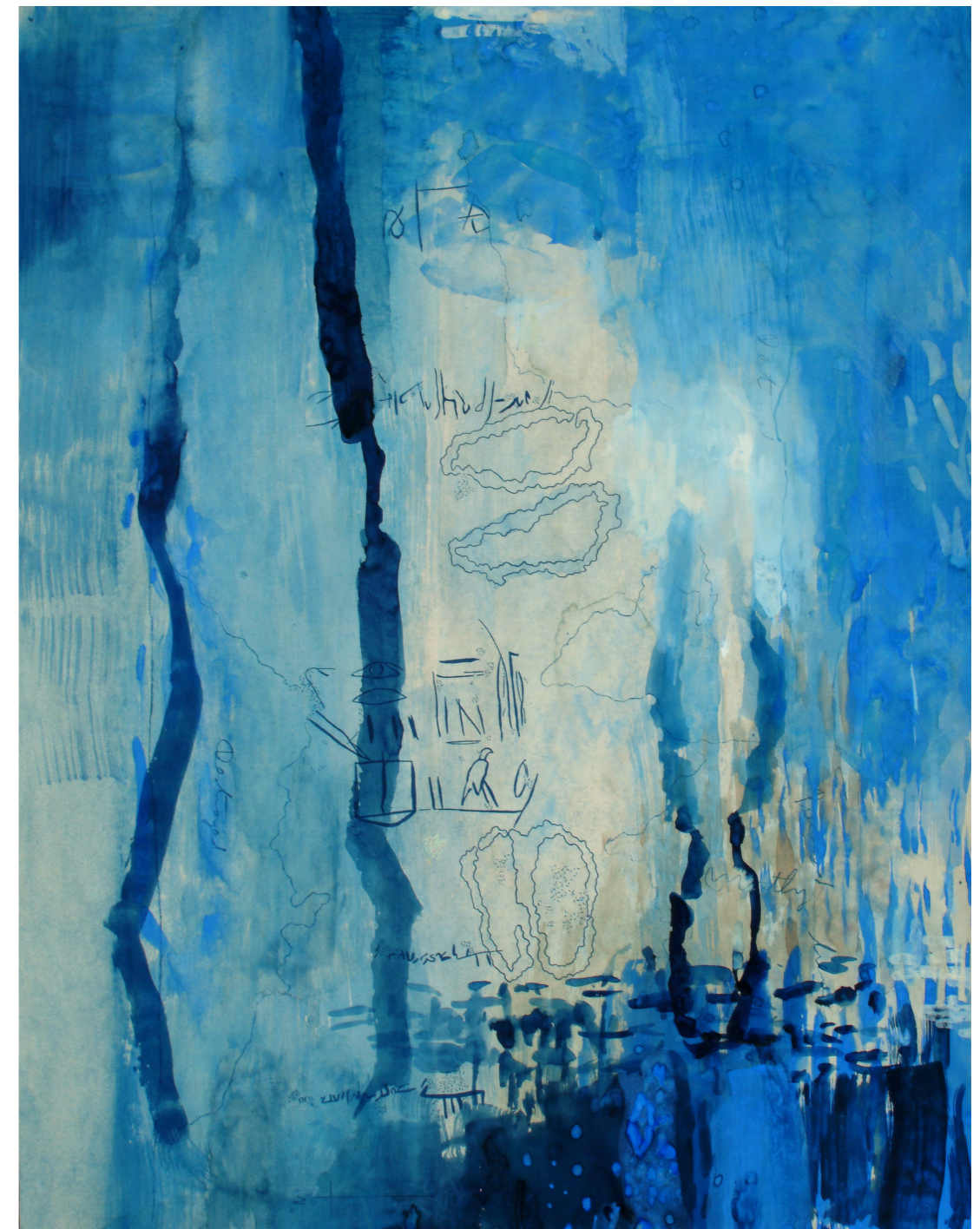
Saved Messages #15, gouache on photo blueprint of ancient graffiti 22 x 17", 55.9 x 43.2 cm, 2006

I found these papers beautiful and fascinating. As I explored the movement of the ancient marks across the paper—deciding whether to incorporate or obscure them—the history of the ancient messages only added to the depth of the piece.