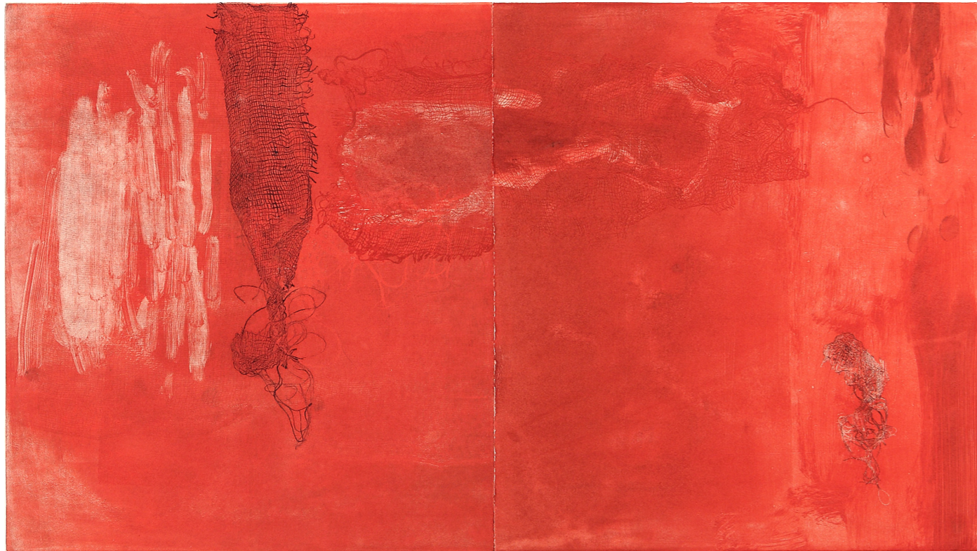
Red Sea #7, monotype print. Diptych 13 x 23.25", 33 x 59 cm, 2009.